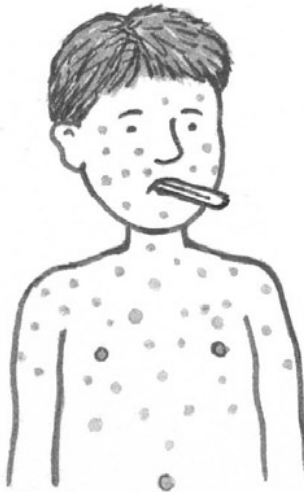
Chicken pox M